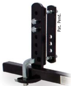
Equal-i-zer's superior rigid trailer bracket assembly.

The Equal-i-zer hitch's rigid bracket design provides two of the Integrated friction Sway Control points. Rigid brackets eliminate the pendulum effect caused by chains that can actually make sway worse! The rigid brackets are stable, and can ease the anxiety caused by weaving down the highway.