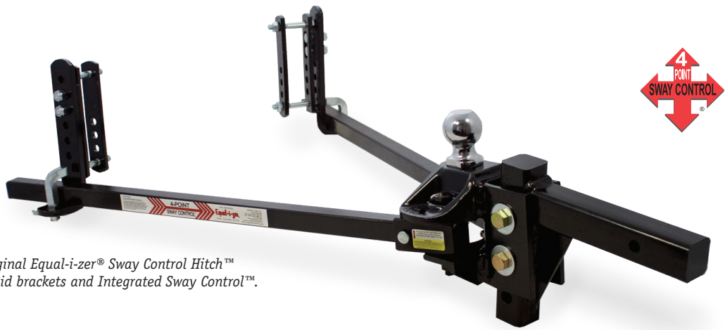
The Original Equal-i-zer® Sway Control Hitch™ with rigid brackets and Integrated Sway Control™.

Superior Performance from the Leader in Integrated Sway Control™